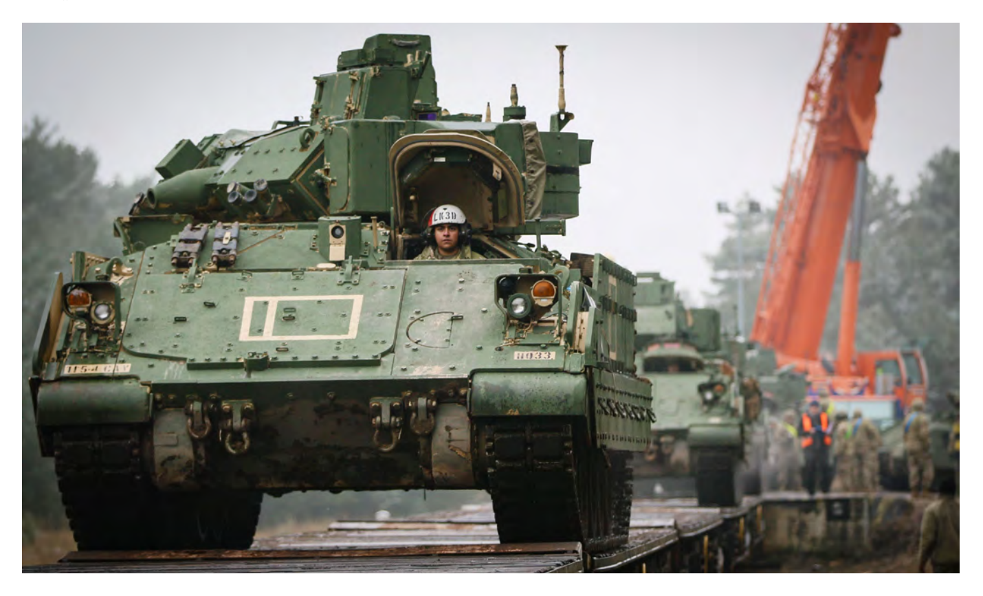
Soldiers with the 5th Squadron, 4th Cavalry Regiment, 2nd Armored Brigade Combat Team, 1st Infantry Division, load heavy equipment onto a train near Swietoszow, Poland, on Dec. 2, 2017, as part of an emergency deployment readiness exercise in support of Atlantic Resolve.