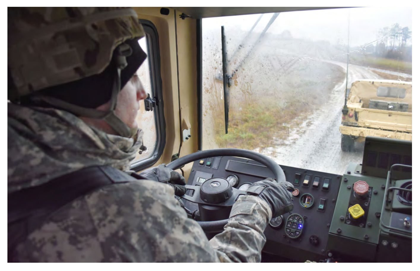
A Soldier drives in a convoy to a key leader engagement during a Transportation Basic Officer Leader Course field training exercise at Fort Pickett, Va., on Oct. 8, 2017.

In one FTX recently conducted at Fort Pickett, students running a convoy with a key leader aboard spent too long at a particular village. The scenario involved taking the key leader to meet with village leaders. However, when the meeting was over, the convoy commander did not move his convoy fast enough away from an area that might have contained hostile forces. Role-playing instructors, seeing this, improvised within the lesson plan and had the convoy attacked by insurgents. One vehicle would have been lost and casualties would have occurred.