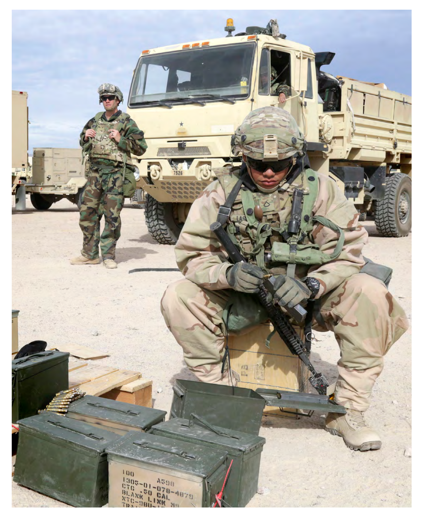
A Soldier assigned to the 1st Brigade Combat Team, 2nd Infantry Division, loads training ammunition during a decisive action rotation at the National Training Center at Fort Irwin, Calif., on April 6, 2018.