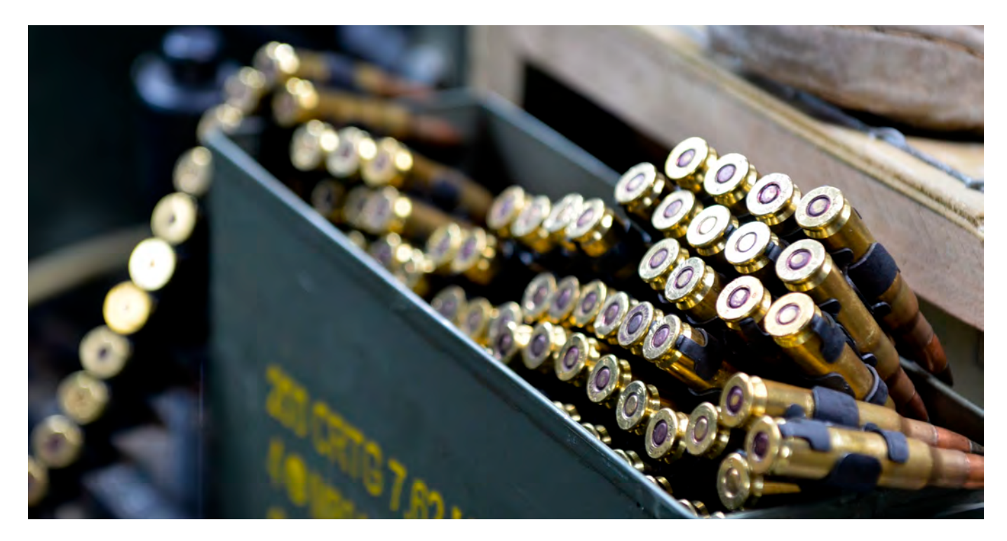
Ammunition belts are given to each convoy live-fire escort team during qualification as part of Operation Cold Steel II hosted by the 377th Theater Sustainment Command at Fort Knox, Ky., on March 23, 2018.