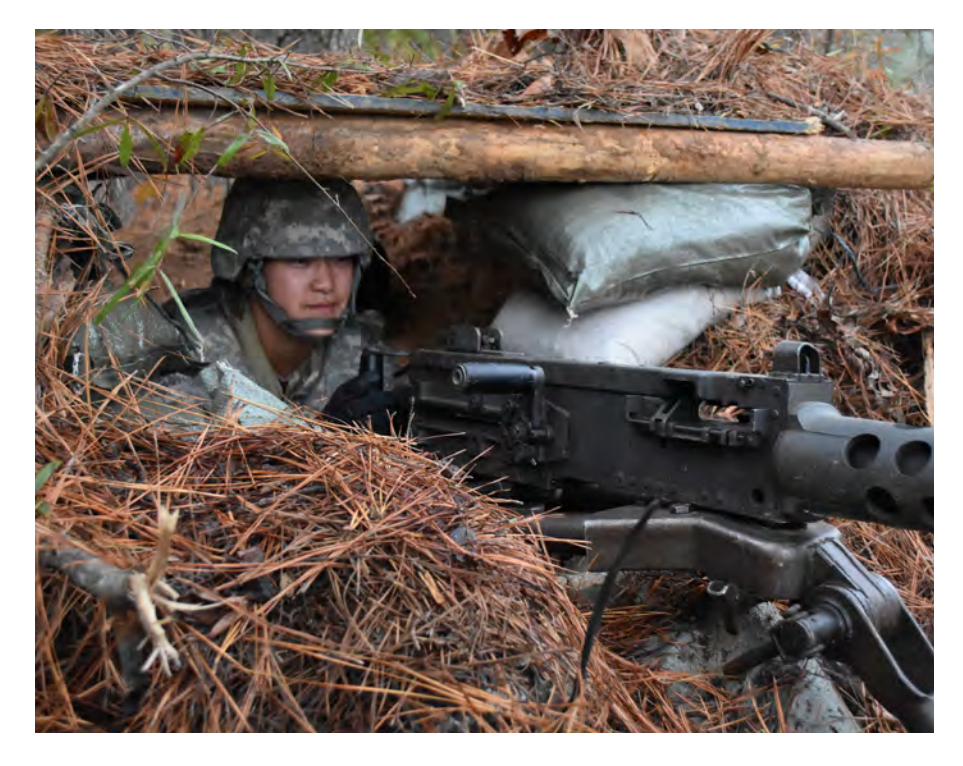
A Transportation Basic Officer Leader Course student pulls guard duty on the perimeter during a field training exercise at Fort Pickett, Va., on Oct. 8, 2017.

The lieutenants fill all leadership positions required to run a convoy support operation. Each day they switch positions and learn how to do new jobs. They conduct nightly battle update briefs and reference the standard operating procedures created for each section. Every lieutenant gets the opportunity to be a convoy commander at least once and conducts a convoy in support of the company's mission.