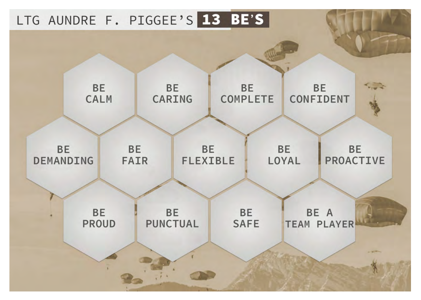
Figure 1. Adhering to these values will allow a Soldier to be successful in any environment, situation, or command climate.

Third, develop imperatives that will improve your skills and make yourself more valuable to your unit. I have my "Piggee Imperatives." I call them the 13 Be's. (See figure 1.) This is not a checklist of what