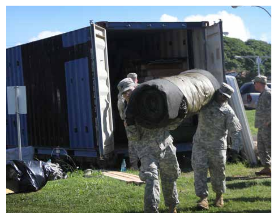
The 593rd Sustainment Command (Expeditionary) sets up its early-entry command post for Exercise Key Resolve on Feb. 19. The equipment arrived aboard a logistics support vessel owned and operated by the 45th Sustainment Command and was transported to the field beside the 8th Theater Sustainment Command headquarters at Fort Shafter, Hawaii.

Army doctrine defines port opening as "the ability to establish, initially operate, and facilitate throughput for ports of debarkation to support unified land operations." The port opening process is considered complete when the supporting infrastructure needed for port operations has been established. Once ports are