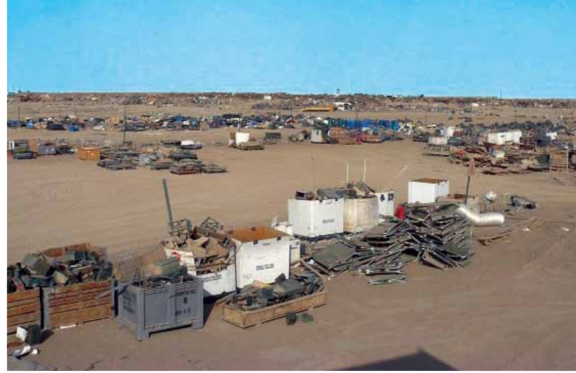
A 15-week mission turned an uncontrolled dumping ground at Contingency Operating Base Adder into a functioning scrap separation area.

BY SERGEANT JAMES KENNEDY BENJAMIN, USAR