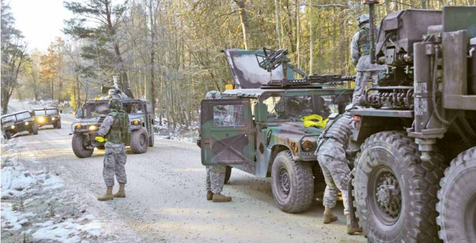
Soldiers prepare to tow a disabled vehicle during recovery training at the Joint Multinational Readiness Center at Hohenfels, Germany.

identify the commander of a unit as the primary trainer. Throughout this phase, tactical aspects of recovery, such as precombat checks and inspections, rehearsals, and tactical movement skills, are demonstrated by unit leaders. Unit leaders also train Soldiers on the basic components of organic recovery equipment, including application, maintenance, and safety.