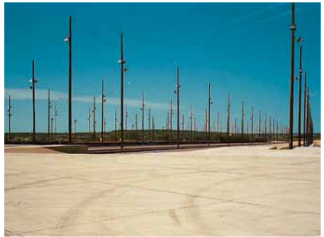
An example of the Army's improved force-projection capabilities is provided by the expansion of the Fort Hood, Texas, rail facility. It has gone from a 4-spur railhead to today's 240-railcar railhead, 300-railcar classification yard, and 45,000-square yard marshalling facility.

It is in this domain that the greatest improvements have occurred. We have significantly enhanced our throughput and capacity at power-projection installations. For example, whereas the railhead at Fort Hood, Texas, in years past had a 4-spur railhead with no supporting facilities, today it has a 240-railcar railhead, a 300-railcar classification yard, a 45,000-square-yard marshalling yard, and the capability to deploy 240 to 320 railcars per day. Similar improvements at the Fort