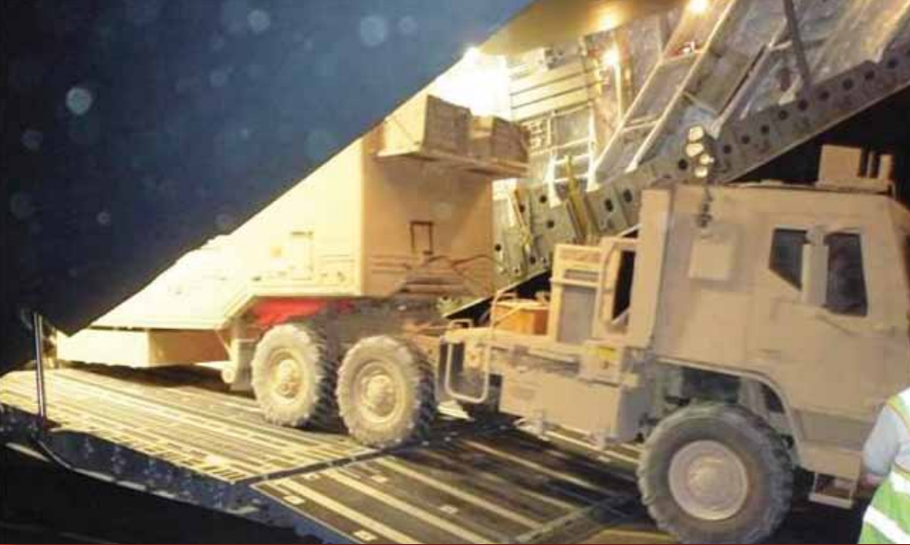
The first two mobile laboratories in Southwest Asia were configured inside M971 semitrailer vans. In this photo, the first mobile lab rolls off an aircraft on its way to the theater.