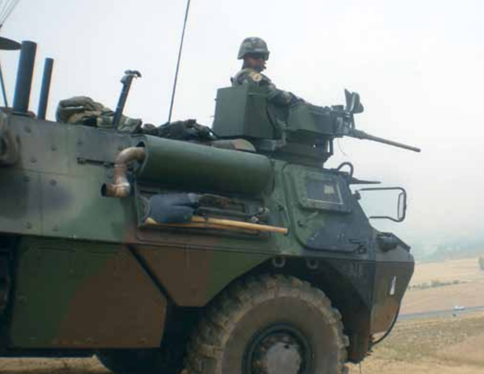
Above, a soldier in a French armored personnel carrier at the entrance to the Saalar Combat Outpost secures an area near Highway 1 during a refueling mission.