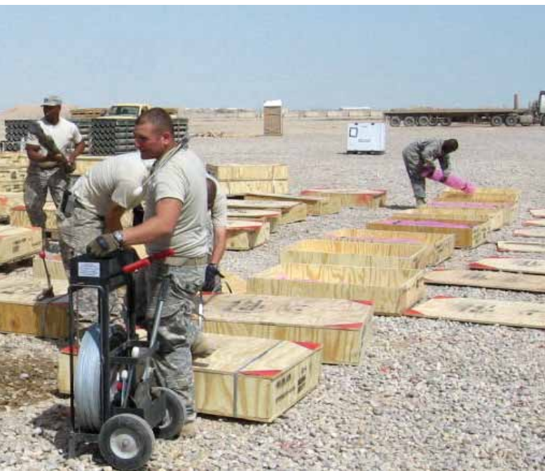
Soldiers assigned to the 664th Ordnance Company demonstrate proper repackaging of munitions in an austere environment at the receiving pad of the Contingency Operating Base Adder-Tallil ammunition supply point near An Nasiriyah, Iraq. The photo shows Soldiers assembling and marking makeshift storage crates (background), wrapping and protecting munitions for storage (left and center), packing munitions into crates to protect them from the elements (right), and banding the crates to prevent pilferage and make handling less dangerous.

for example, the company leaders recognized early on that a collective deficit in predeployment MOS training could not be made up solely through on-the-job training (OJT). By combining the principles of OJT with some unique methods, however, it became possible to give most company personnel the breadth and depth of MOS training they would need to be successful during their current deployment and in future ammunition supply assignments.