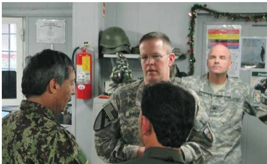
The director of the Integration Cell, Security Assistance Office-Afghanistan, briefs the Afghan National Army G-4 on the mission of the foreign military sales division of the Security Assistance Office-Afghanistan.

I had many issues to cover while I was assigned as FMS chief. The components of the ANSF—the Afghanistan National Army (ANA), Afghan National Air Corps, and Afghanistan National Police (ANP)—