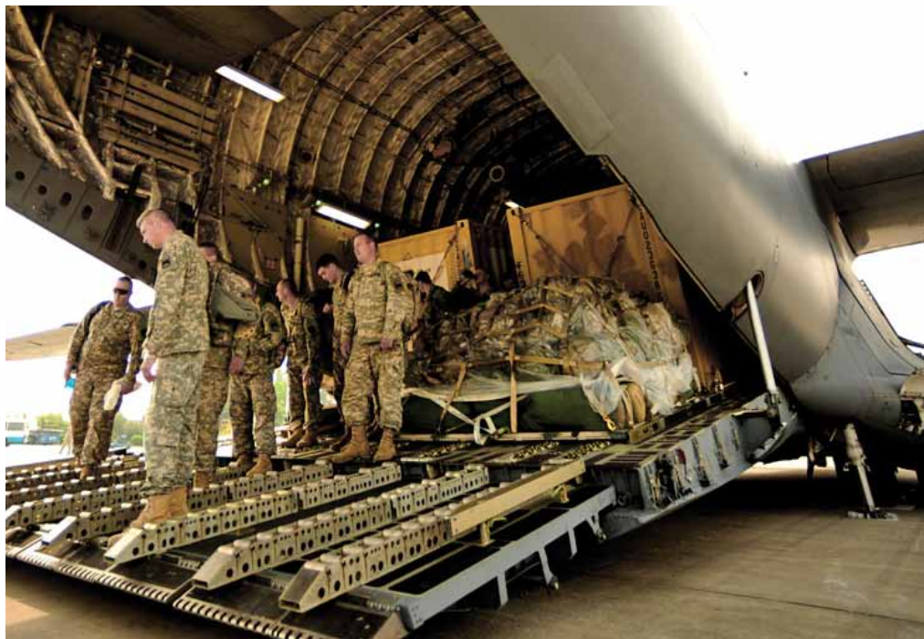
Soldiers arrive in Pakistan aboard a C-17 Globemaster III with supplies in support of flood relief efforts. The aircraft is the most flexible to enter the airlift force.

The C-17 Globemaster III, the most flexible cargo aircraft to enter the airlift force, has replaced the C-141 Starlifter as our principal cargo lifter. It is capable of rapid strategic delivery of troops and all types of cargo to main operating bases or directly to forward bases. The C-17, designed to provide direct delivery of cargo loads