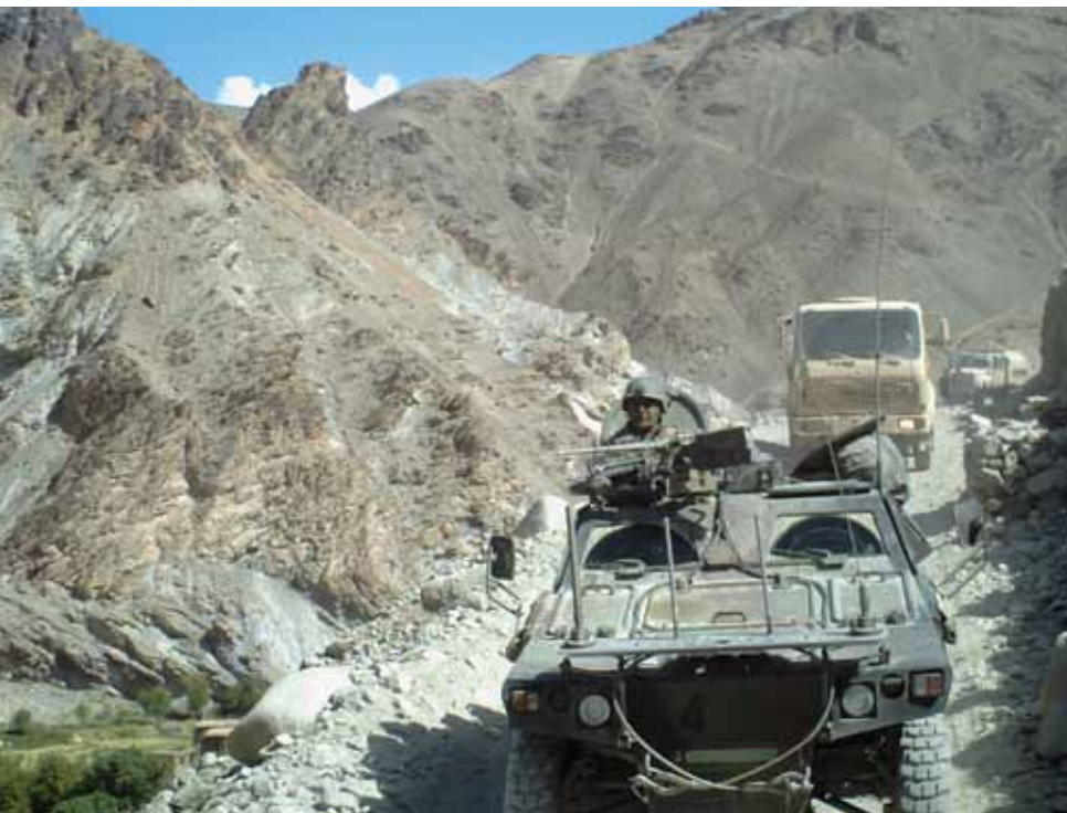
Below, a French light armored personnel carrier and two Afghan fuel tankers proceed in a convoy in the Bamiyan Mountains.

are not. The enemies have no front line and attack the logistics convoys throughout the whole area of operations. The notions of front and rear do not exist. It is a modern conflict in which logisticians support the farthest forward operational bases and ensure resupply missions are everywhere.