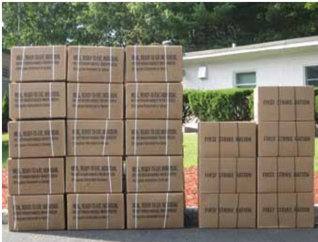
First Strike Rations contain a day's supply of food for warfighters on the move. The rations are also half the weight and volume of three daily meals, ready-to-eat.

highly mobile and high-intensity combat operations. Each First Strike Ration contains a day's supply of food, averaging a total of 2,900 calories, while at the same time reducing the Soldier's load. One ration, in place of three daily meals, ready-to-eat, saves 49 percent in weight, 55 percent in space, and 22 percent in costs.