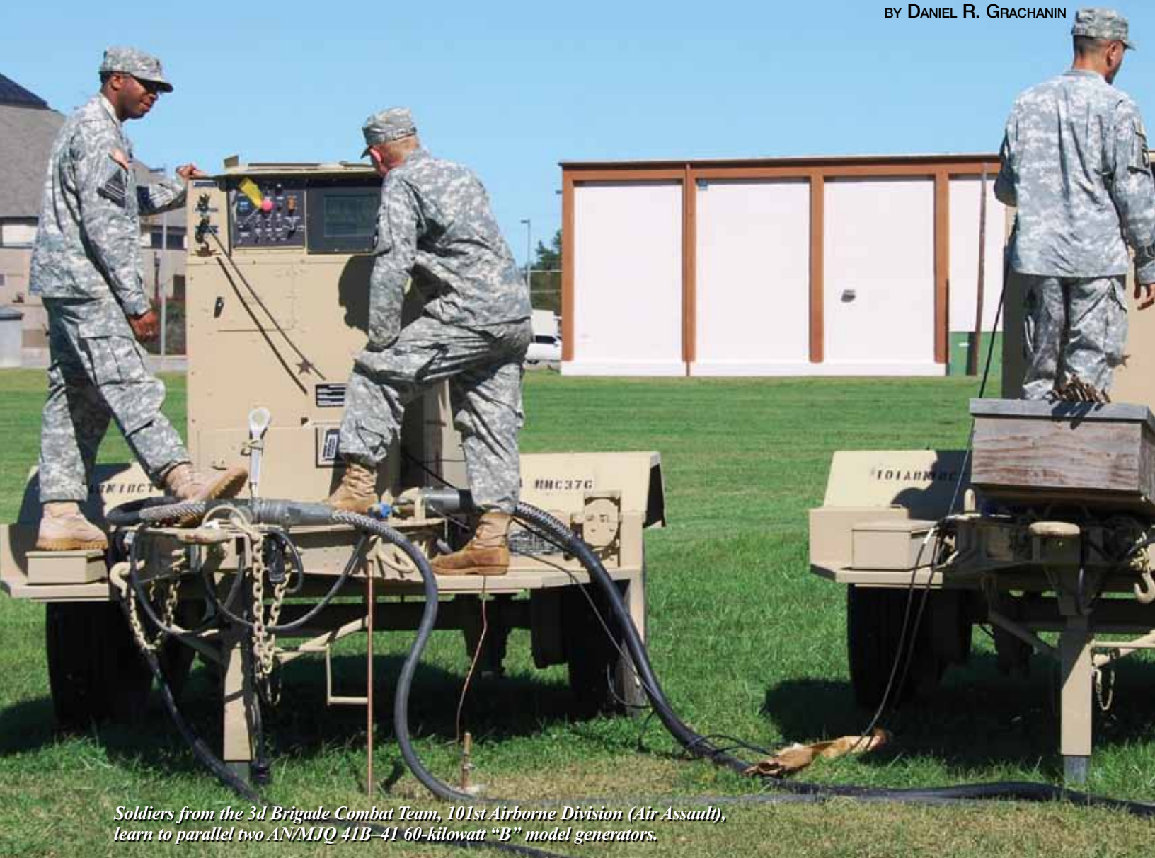
Soldiers from the 3d Brigade Combat Team, 101st Airborne Division (Air Assault), learn to parallel two AN/MJQ 41B-41 60-kilowatt "B" model generators.

B ullets and bombs are no longer the only risk to being in a war zone. Something as simple as taking a shower or washing a vehicle can claim the life of someone defending our Nation. These routine activities can become life threatening to Soldiers because of overloaded circuits, inadequate extension cords, and improperly emplaced breaker lines in the power system. Several Soldiers have died from electrocution caused by these problems.