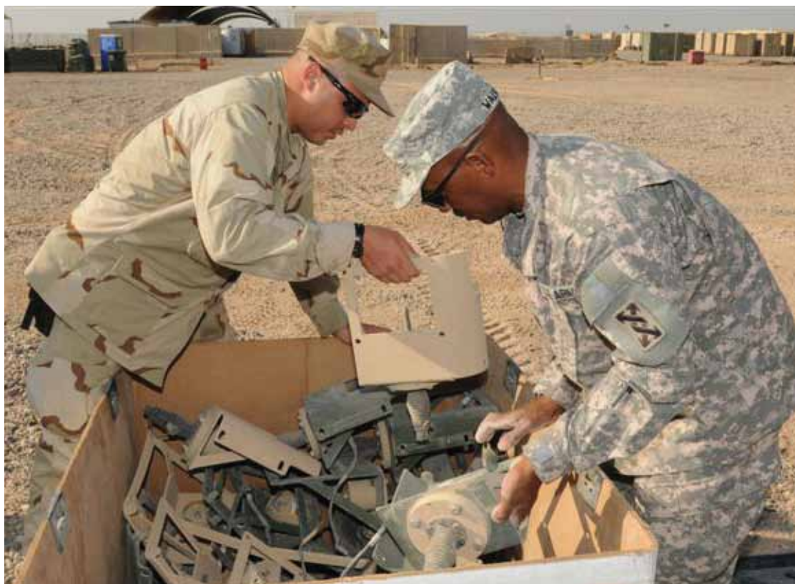
The 319th Transportation Company non-commissioned officer-in-charge of the mobile redistribution teams for Operation Clean Sweep inspects excess supplies with a chief petty officer from Riverine Squadron 1 in Basra, Iraq, on 4 November.