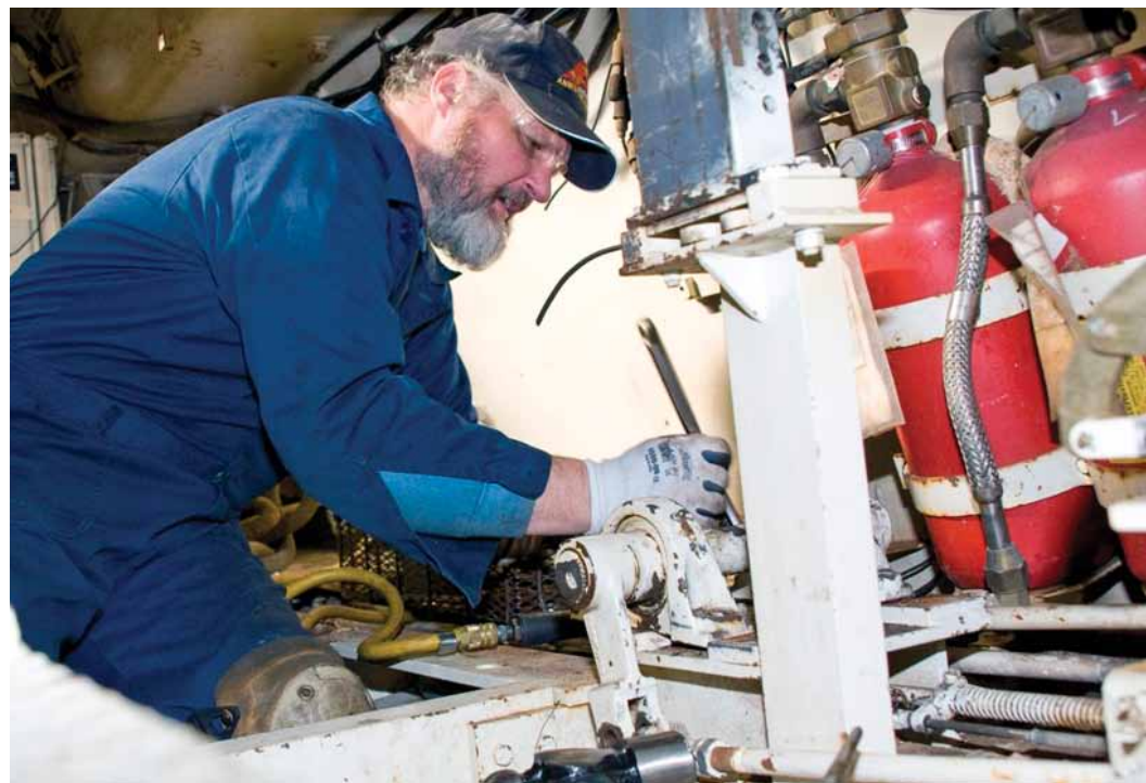
A mechanic at Anniston Army Depot, Alabama, dismantles an M88 recovery vehicle. Army depots and arsenals have won 26 highly-coveted Shingo Awards for production and manufacturing excellence in the last 5 years.

balanced Army, better business processes, shorter cycle times, and reduced costs.