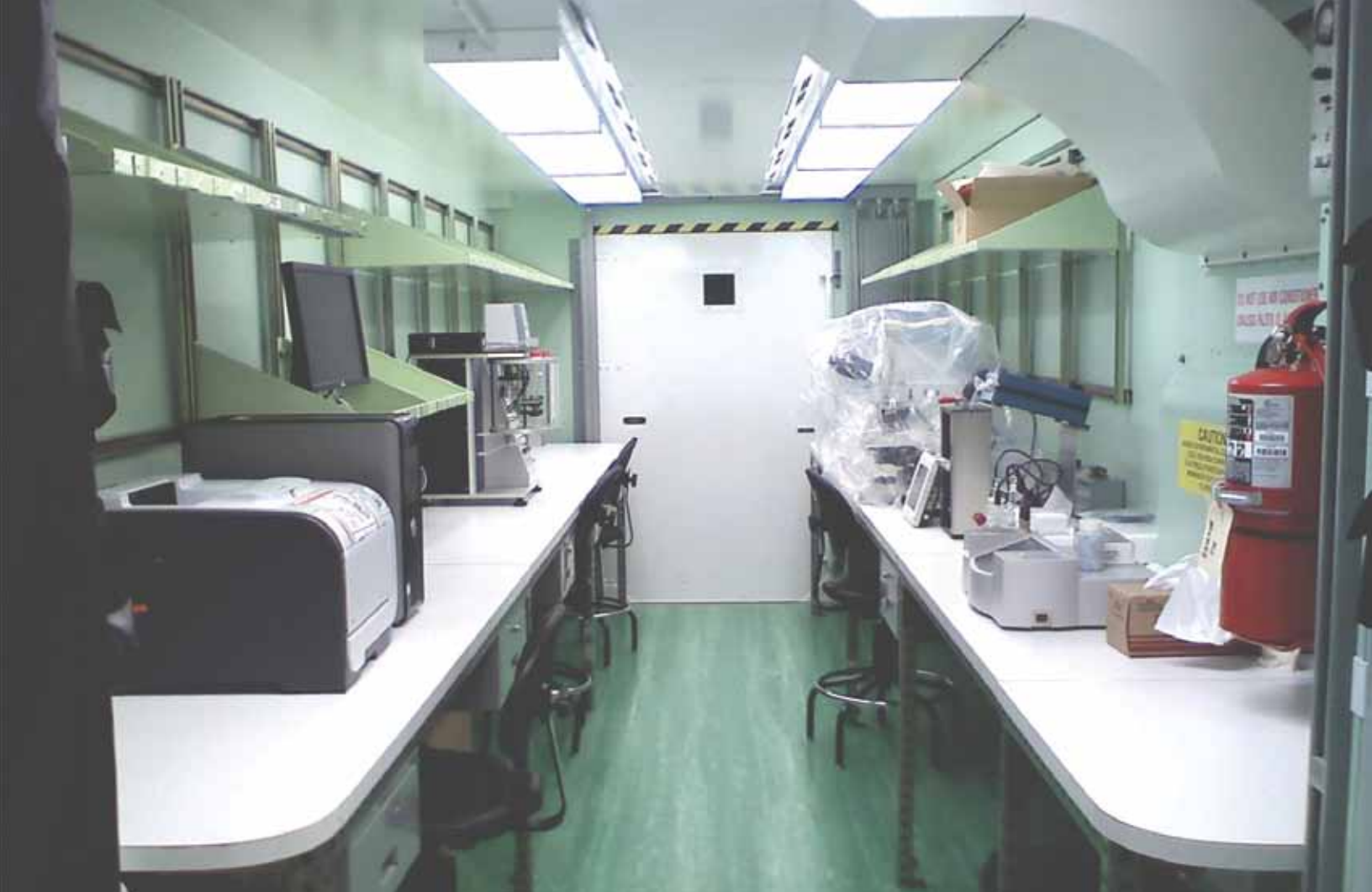
Shown is the interior of the new AOAP mobile laboratory facility at Camp Marmal, which meets 100 percent of the 4th Combat Aviation Brigade's oil sampling requirements.

facilities were delivered on 15 July, all internal modifications were completed, diagnostics equipment was installed and tested, operating supplies were procured, and the lab was packed up and made ready for air transport to Southwest Asia.