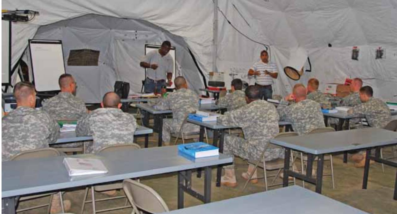
Students use a trailer-mounted support system tent as a classroom during their CPS TOC training. They learn extensive electrical theories and safety before engaging in the hands-on portion of the training.

Ayer to create a power training course for an infantry brigade combat team (IBCT) CPS tactical operations center (TOC), which would be taught by CECOM IT-FSB power production instructors.