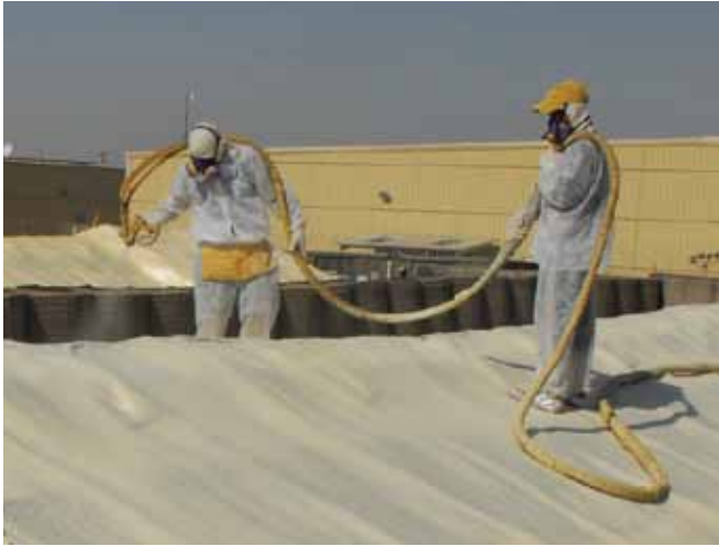
The Army had spray foam insulation applied to temporary structures in Iraq and Afghanistan, which reduced fuel consumption and thereby took fuel convoys off dangerous roads.

to austere airfields, has been used extensively in Afghanistan. It can land with payloads of up to 160,000 pounds on austere runways as small as 3,500 feet by 90 feet.