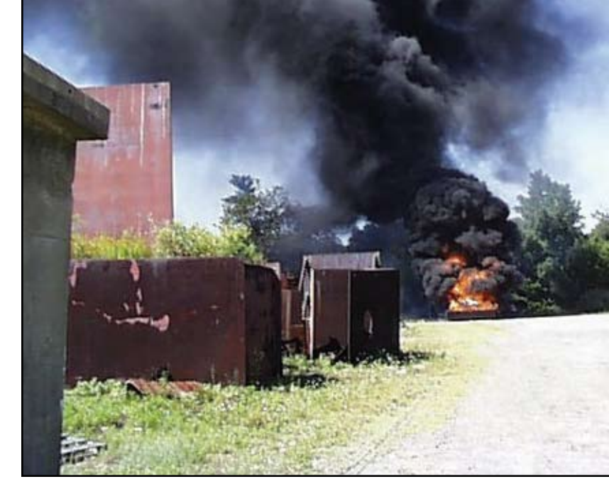
The containers are engulfed in flame during the test.

All munitions acquired by the military services must be examined to determine if they meet established IM requirements. This is true whether the munitions are developed by the services or procured from commercial or foreign sources. This examination normally involves a series of six tests designed to assess the ability of munitions (typically in their shipping configuration) to withstand shock, heat, and impact. The specific tests are identified during a threat hazard assessment conducted by the acquiring service. The six tests normally include fast cookoff, slow cookoff, sympathetic detonation, bullet-impact, fragment-impact, and shape-charge jet impact tests. These test requirements, methods of conduct, and passing criteria can be found in Military Standard (MIL-STD)-2105, Hazard