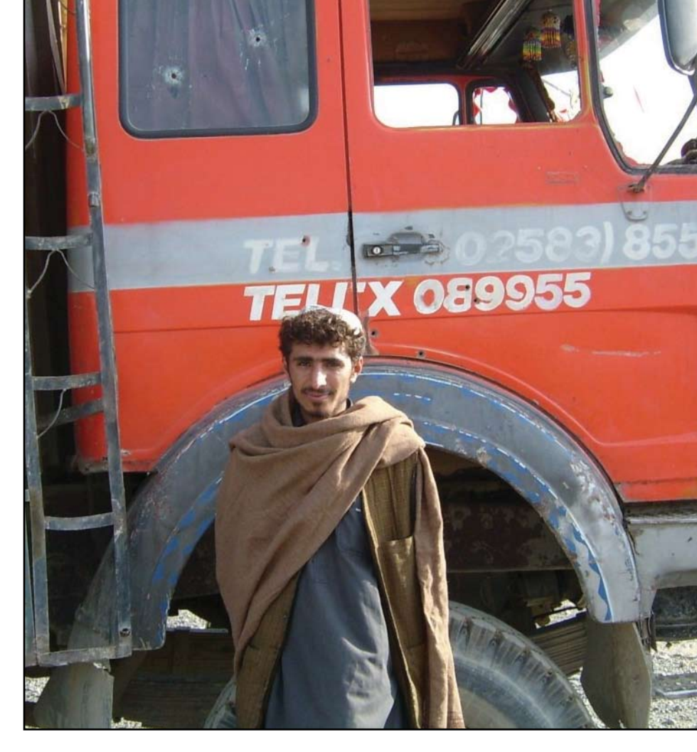
A contracted Afghani driver stands beside his bullet-riddled "jingle truck."

The use of contractor logisticians has increased significantly in the last decade. Theater commanders have adapted rapidly and have provided sustained force protection to the many contractor convoys operating in the theaters. However, because of the limitations of unarmed contracted civilians, the adaptive techniques of terrorists and insurgents, and a limited number of trained military police and other combat and support units available for convoy security missions, contractor convoy force protection remains a challenge in theater. Now more than ever before in our history, the