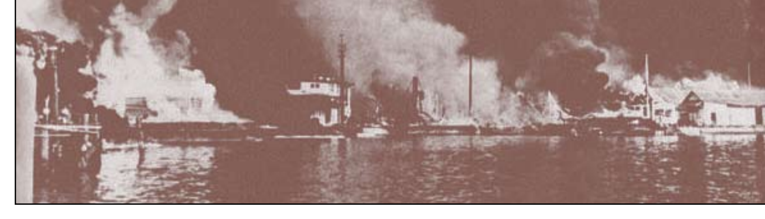
Clark Airfield burns on 7 December 1941 after the Japanese attack.

Although most supplies for the Regular U.S. Army establishment had arrived before the war, supplies for the Philippine Army had not. Expected first in late October and then in late November, the convoy carrying quartermaster supplies was diverted to Australia after 8 December. The supplies and equipment requisitioned for the Philippine Army never did arrive. The Filipinos would go into battle with whatever they had been issued from local U.S. Army stocks or could be purchased from the local economy.