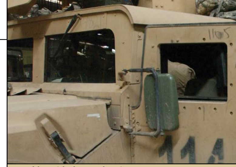
A welder with the 503d Maintenance Company disassembles an old combat lock on a humvee door at Forward Operating Base Falcon. He will replace it with a new combat lock with a single-action mechanism that allows the door to be opened with one motion.

A Soldier installs a gunner's harness bracket on a humvee. This gunner restraint keeps the Soldier from being ejected from the vehicle during a rollover or sudden stop.