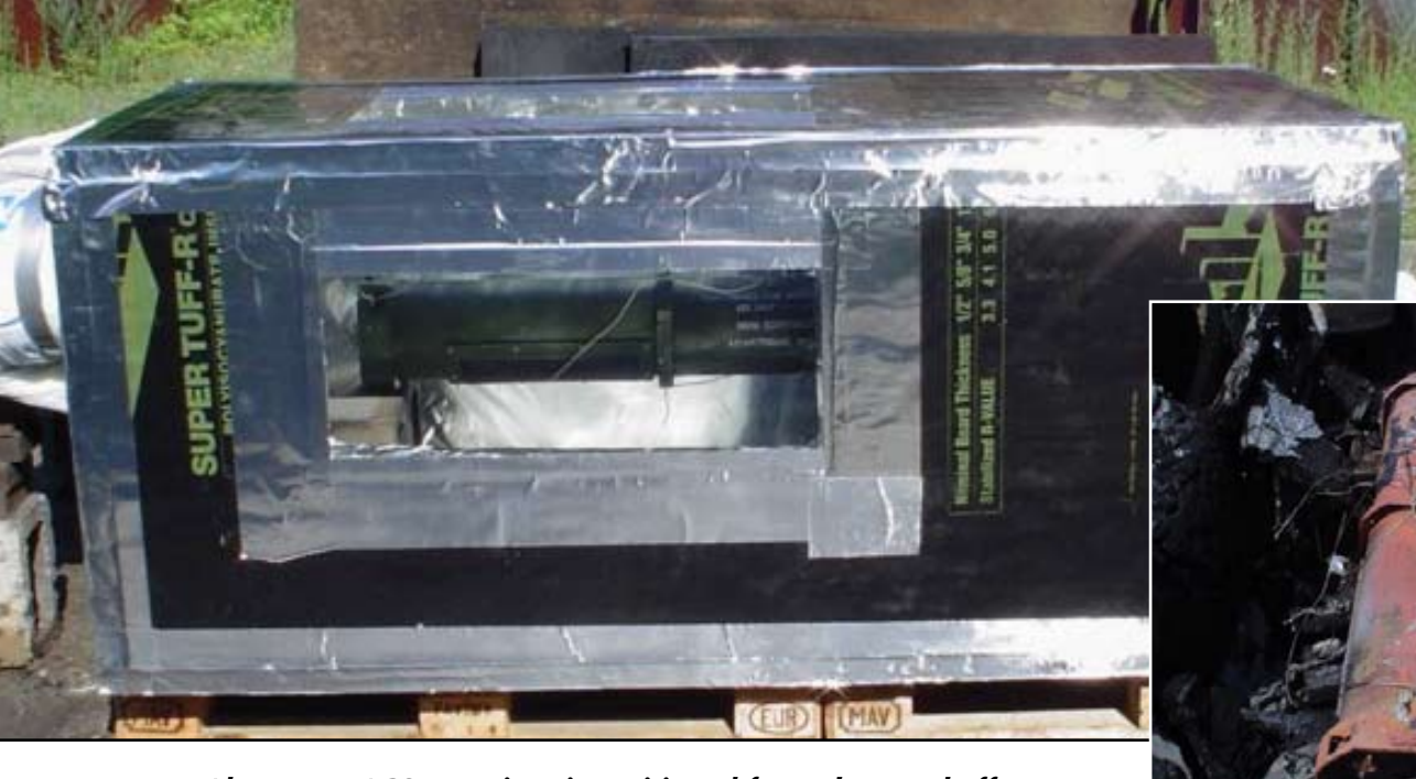
Above, a MACS container is positioned for a slow cookoff test. At right, the container is shown after a successful test in which the munition did not explode.

Bullet- and fragment-impact tests are performed to check a munition's reaction to small-arms fire and impact from high-speed fragments that may come from sources such as exploding bombs or artillery shells. Depending on the threat-level assessment (what the Army thinks might be fired at the particular type of munition being tested), various rounds are fired at the munition in its container. The projectiles vary from 5.56 millimeters up to .50 caliber for the bullet-impact test. Both armor-piercing and ball ammunition are used. The Department of Defense has developed more specific criteria for the fragment-impact test, which includes size, shape, and speed of the fragment. If the munition's reaction is no worse than burning and no hazardous fragments are thrown, it passes these tests.