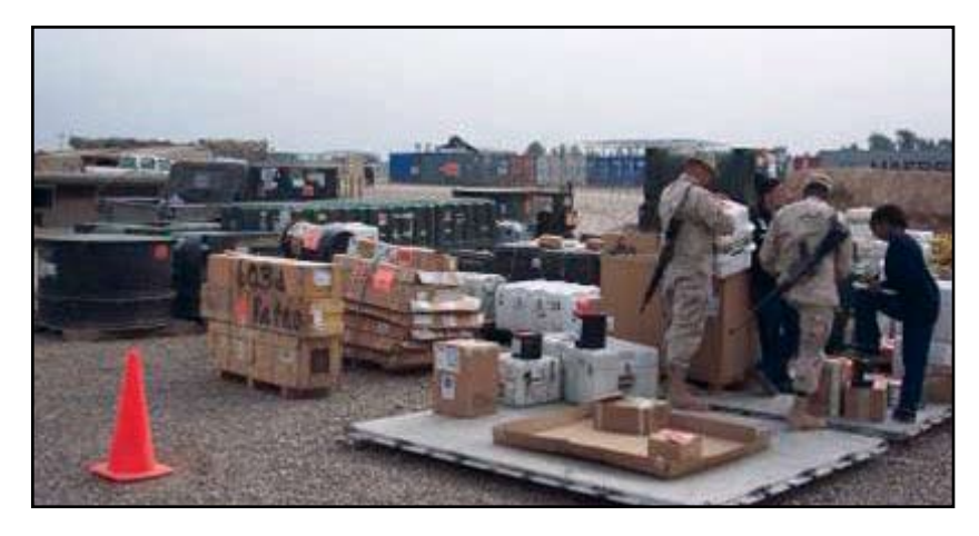
Mission Analysis Team

Within a month of its arrival in Kuwait, the 1106th AVCRAD sent a mission analysis team to Iraq to determine the warfighters' forward depot operations needs. The key problems identified by the team were difficulty in moving maintenance contact teams and components within the theater and in communicating requirements from units in Iraq to the AVCRAD in Kuwait.