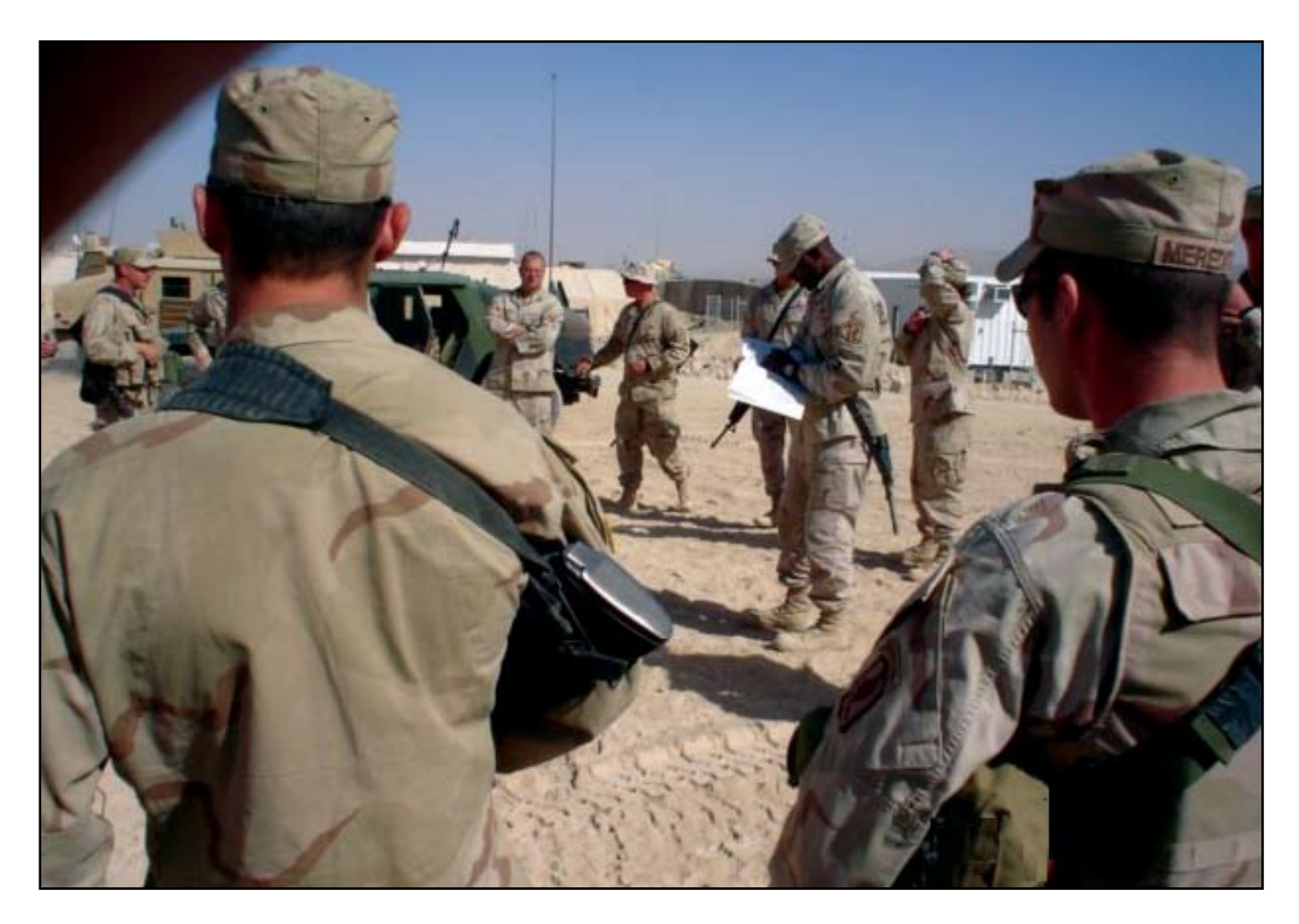
In southern Afghanistan, Soldiers of the 173d Support Battalion (Airborne) are briefed on an upcoming combat logistics patrol.

The rehearsal agenda shows which vehicles are in the line of march; where the weapons check will be conducted; the start point location; the route of march; key terrain features along the route; chokepoints; potential problems associated with driving through urban areas; potential ambush areas; and actions to be taken on contact, when crossing friendly boundary lines, moving into a friendly forward operations base, and at the release point. To be effective, the rehearsal must include everyone in the CLP and use a terrain model that is similar to the area the CLP will cover. The rehearsal area should be quiet and free of distractions. The CLP leader should ask the Soldiers questions during and after the CLP rehearsal to ensure that everyone understands the mission.