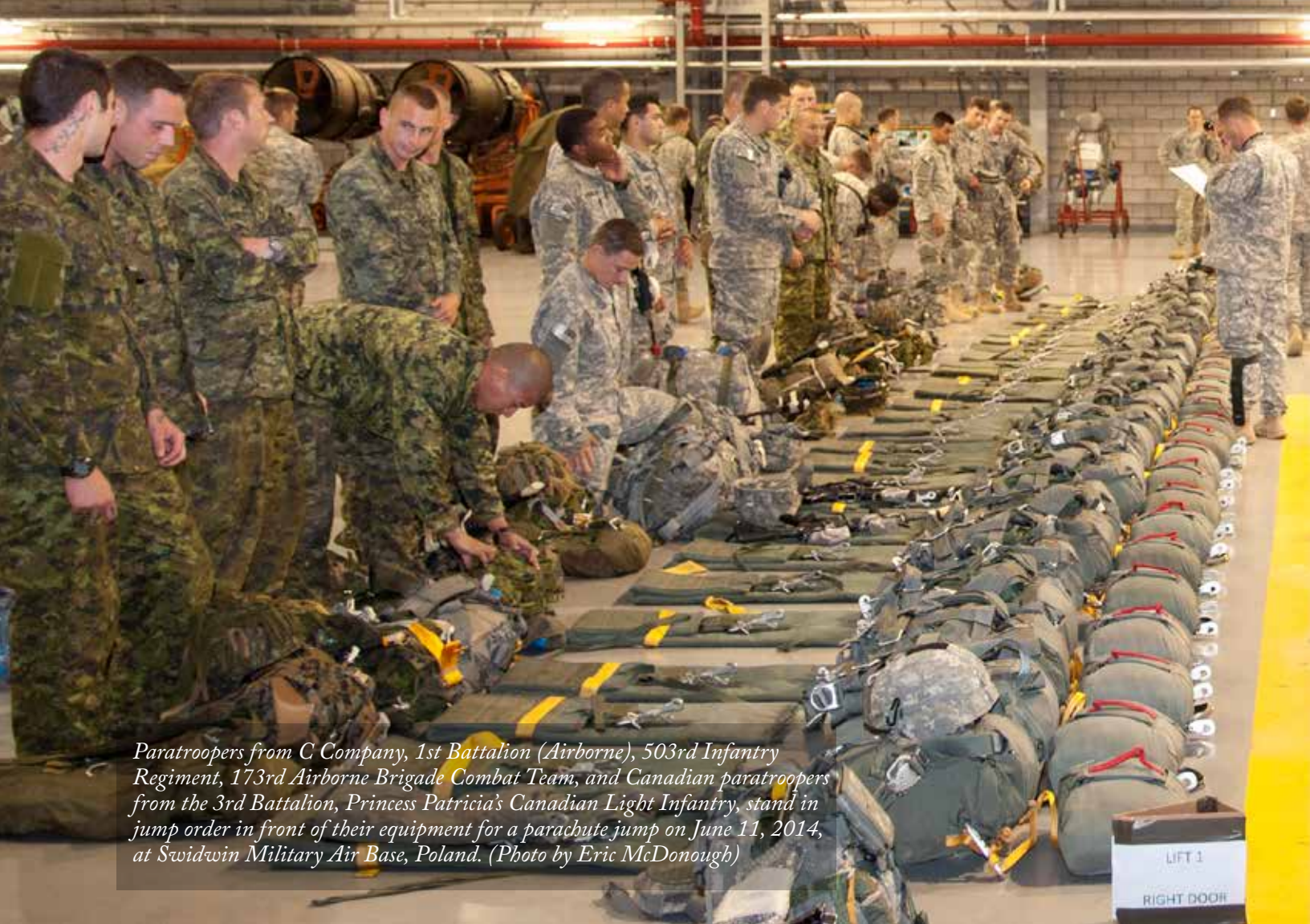
Paratroopers from C Company, 1st Battalion (Airborne), 503rd Infantry Regiment, 173rd Airborne Brigade Combat Team, and Canadian paratroopers from the 3rd Battalion, Princess Patricia's Canadian Light Infantry, stand in jump order in front of their equipment for a parachute jump on June 11, 2014, at Swidwin Military Air Base, Poland.

established and able to receive forces, the Army's sustainment commands organize and control the movement of forces to forward locations for integration with assigned forces.