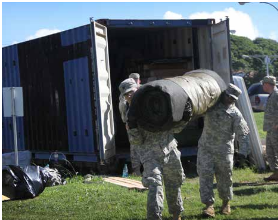
The 593rd Sustainment Command (Expeditionary) sets up its early-entry command post for Exercise Key Resolve on Feb. 19. The equipment arrived aboard a logistics support vessel owned and operated by the 45th Sustainment Command and was transported to the field beside the 8th Theater Sustainment Command headquarters at Fort Shafter, Hawaii.

Army doctrine defines port opening as "the ability to establish, initially operate, and facilitate throughput for ports of debarkation to support unified land operations." The port opening process is considered complete when the supporting infrastructure needed for port operations has been established. Once ports are